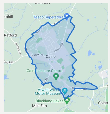
Calne Town Centre